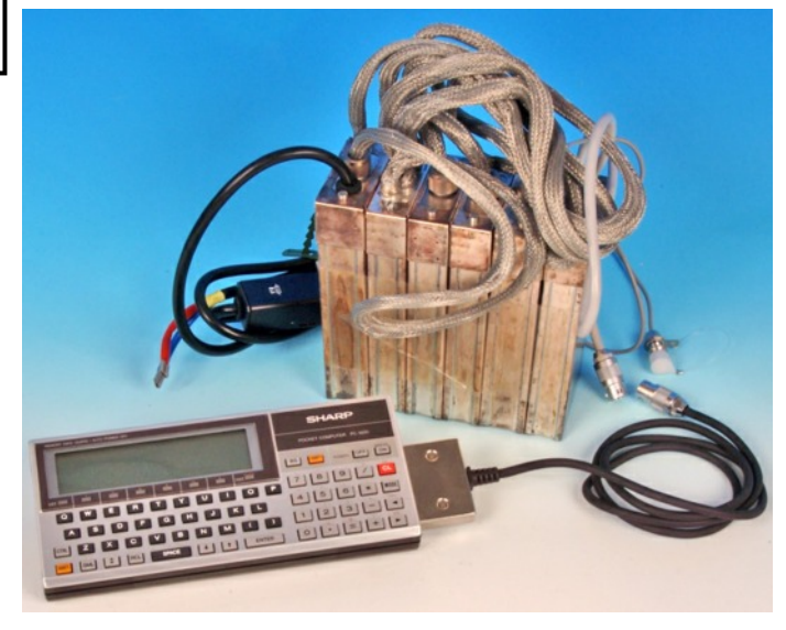
WSA 6 six-module variant for covert installation in e.g. a vehicle. A commercial Sharp PC 1600 (below) was used as control unit.

Two variations are noted: a compact variant fitted in a metal box (see photo on top left) and a six-module variant for covert installation (bottom left). It was normally used with high speed keyer 32843, described in Chapter 139.