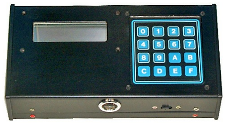
WSA 6 transmitter 32212, (left) and associated high speed keyer 32843 (above).