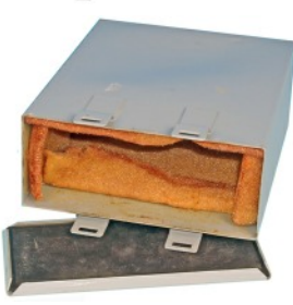
The MEZ 12, cover name 32213, was part of the WSA 6 system at the base side, normally in combination with an EKD 300 receiver. (Above)

Size (cm): Height 14.7, length 14.4, width 6.7.